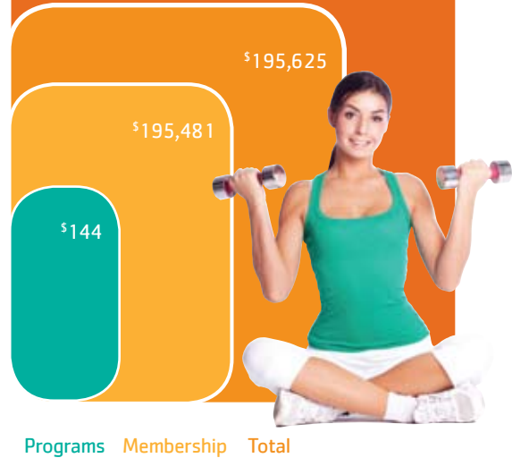
Programs Membership Total